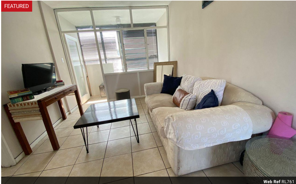
Web Ref RL761